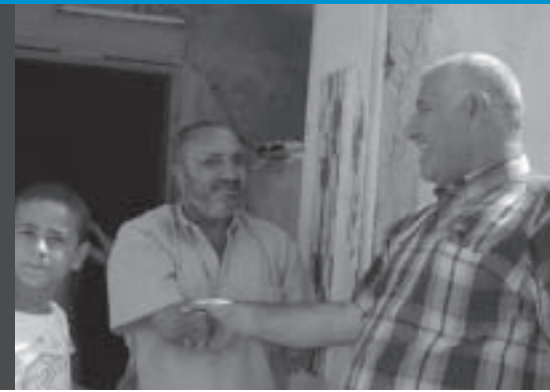
Survivor Corps staff member meeting one of the survey participants in Jordan